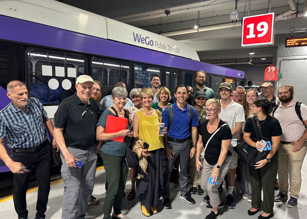
TCLA Class 25 meets at the Elizabeth Duff Transit Center Downtown to ride the bus to Conexion Americas for a class session.