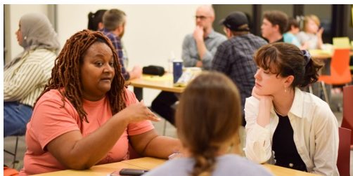
Community members gather to discuss mobility challenges and their preferred solutions at Transit Together.

We didn't just collect these insights; we took them straight to the decision-makers. WeGo , NDOT , and the Mayor's Office all received the findings from Transit Together , and it's clear: Our voices were heard . The alignment between the community's feedback and the Choose How You Move plan demonstrates how critical this input has been in shaping policy and