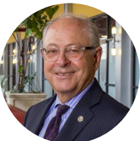
Mayor Ken Moore