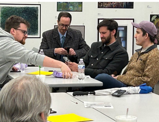
Community members discuss mobility challenges they face every day and their preferred solutions.