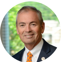
Mayor Randall Hutto